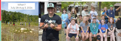
When? July 28-Aug 3, 2024