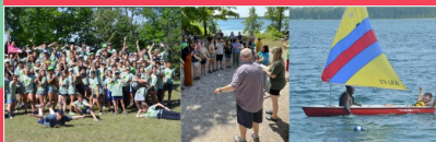
Registration is now open! 4-H Great Lakes and Natural Resource Camp! https://www.canr.msu.edu/4_h_great_lakes_natural_resources/camp/